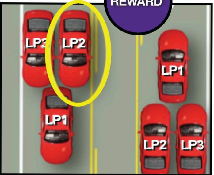
Lane Positions LP1, LP2, LP3

Fold on lines. Use glove box as a holder.